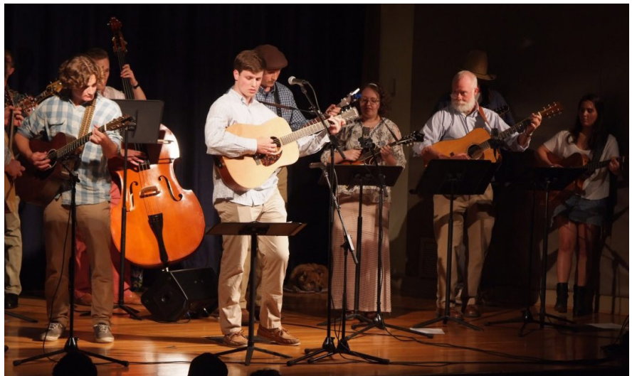
The Bluegrass Ensemble concert in Stackhouse Theater in April