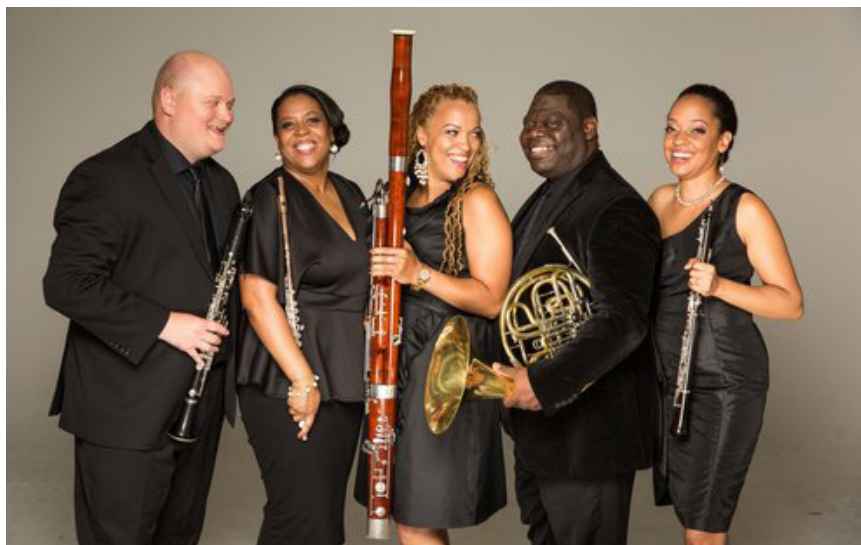
Imani Winds