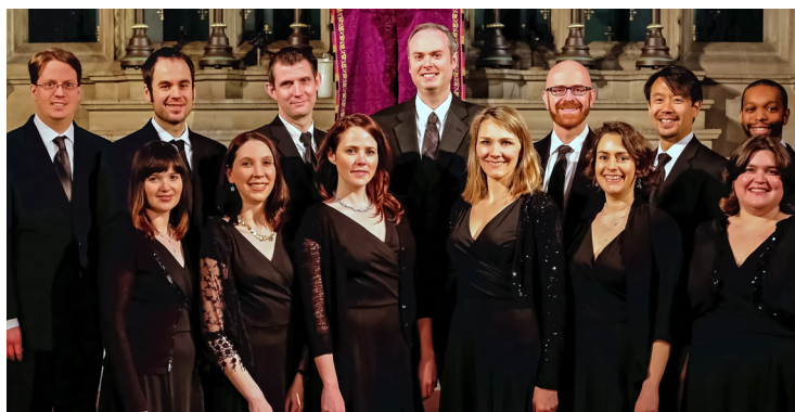
Antioch Chamber Ensemble

The magnificent Antioch Chamber Ensemble returns for a mini-residency and concert on November 10. This chamber choir from New York City performed a fine concert here in February 2017.