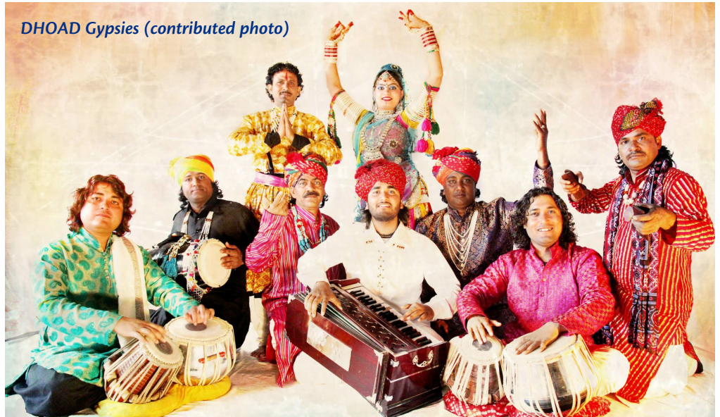
DHOAD Gypsies

the excellence of her playing and singing. Griots are poets, musicians and storytellers who maintain the tradition of oral history in parts of Africa. While on campus, she will visit classes and present a master class. This concert is presented free of charge through the support of the Africana Studies Program, the Center for International Education, the Department of Music and the Office of the Provost.