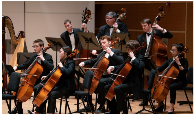
The University Orchestra concert in March