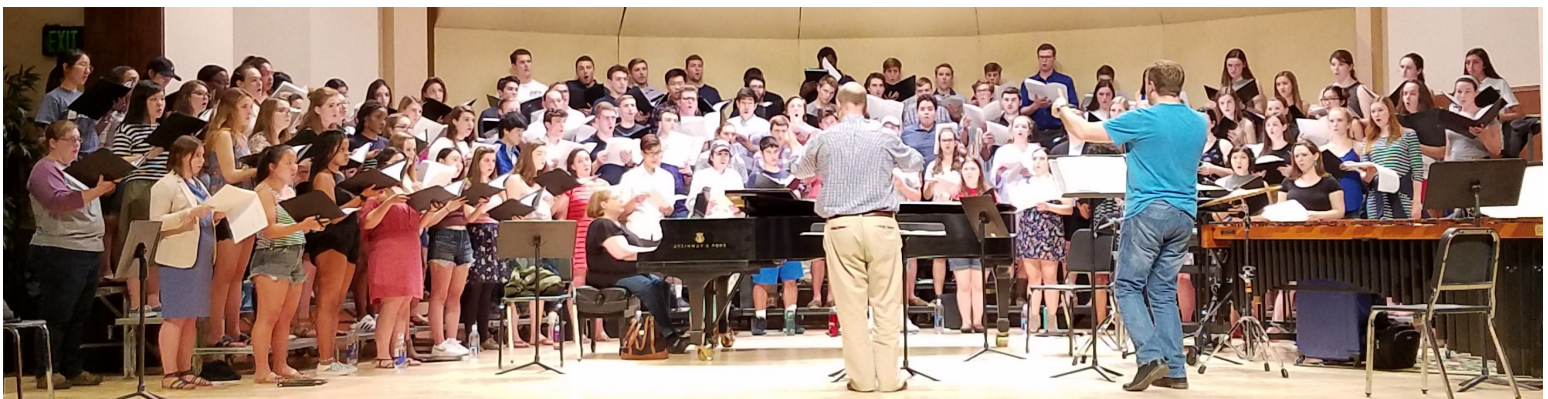
W&L's University Singers and University of Richmond Choirs with Ēriks Ešenvalds, R, in the blue T-shirt and jeans

Requiem by the Glee Club and Cantatrici. However, the highlight of the year was the University Singers joining with the choirs of the University of Richmond and the professional ensemble 8th Blackbird for the world debut of Ēriks Ešenvalds' newest composition, "A Woman and Her Bear." He and the choir were able to work with Ēriks for three days, learning an enormous amount from one of the best choral composers of his generation. The end of the year brought with it many tears at the Commencement Concert, drawing a great year to a meaningful close.