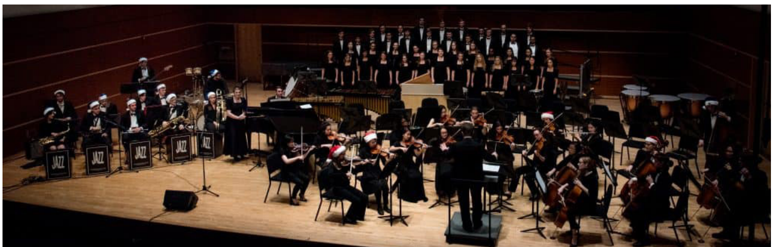
The Holiday Pops Concert in December