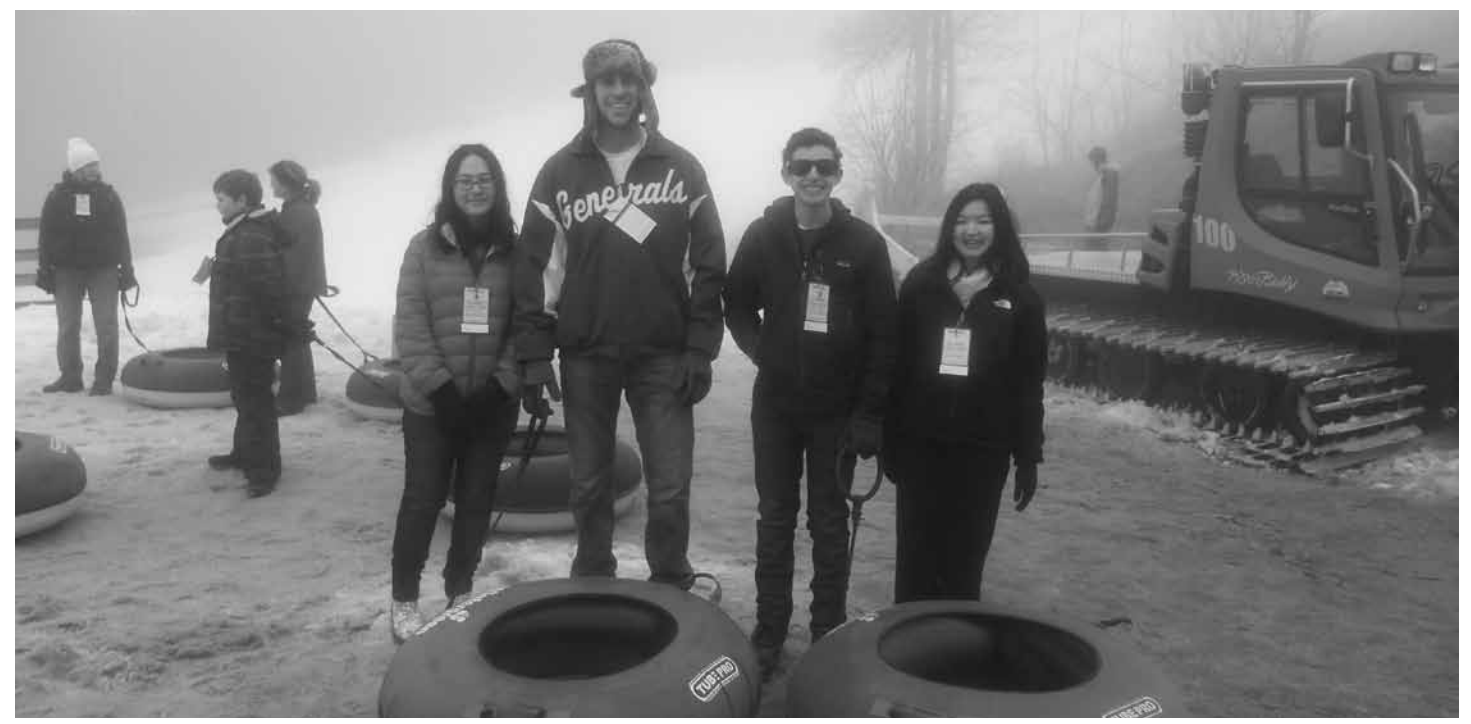
First-year students bonding while snow tubing at Wintergreen Resort.

Passover 2012 was a very exciting celebration, perhaps because it was the first service of this type that I have attended, but I find it hard to imagine that any Passover celebration is not at least moving or stirring. It is the celebration of a people's exodus from Egypt, a country in which they were oppressed by slavery and religious discrimination. During the service we ate the traditional items on the Seder plate, we recited the ten-plagues that descended upon the Egyptians, and we ate the unleavened bread just as the Israelites did when fleeing from Egypt. Attending Passover was just another confirmation to me that W&L's Hillel is a tightly-knit community that is part of a bigger world of ancient and sacred traditions that I have begun appreciate because of the welcoming arms of the groups' members.