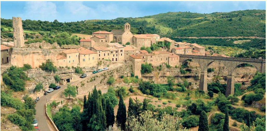
Considered one of the most beautiful villages in France, the hilltop village of Minerve is the historic capital of the Minervois region and offers old-world charm amid abundant terraced gardens and cobblestone streets.

The quaint town of Gaillac is located in one of the oldest wine-growing regions in France, where narrow, cobblestone streets are lined with bâtisse à colombages