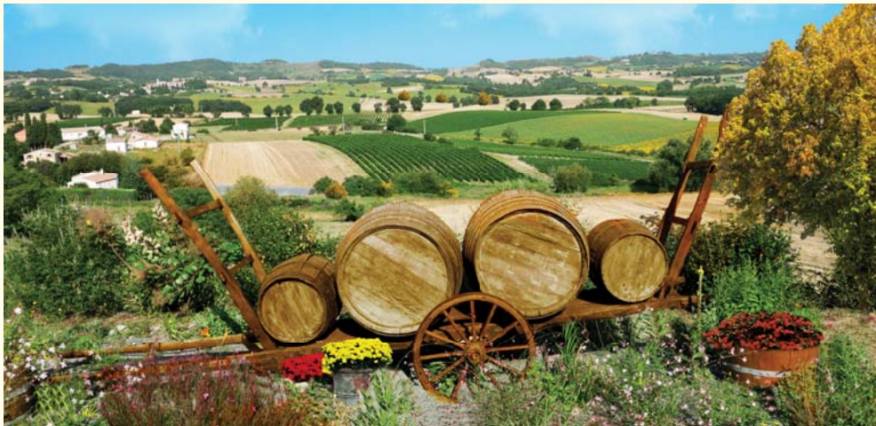
The small villages and verdant, rolling vineyards that dot the landscape of the historic Languedoc region have produced some of the most celebrated wines in France and the world for over 2600 years.