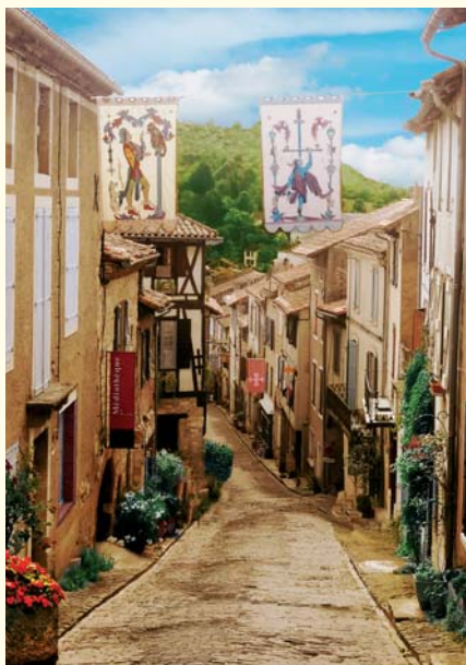
Cover: The fortified walls and cobblestone byways of medieval Carcassonne have remained intact since approximately 100 B.C.