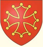
Languedoc Coat of Arms.

Experience firsthand the fascinating destinations and historic provinces that comprise captivating Languedoc—the western half of Mediterranean France that extends from the Alps to the Pyrénées—where la vie unfolds amidst centuries-old medieval villages, lively outdoor markets, verdant countryside and hectares of lush vineyards that produce some of France’s best wine.