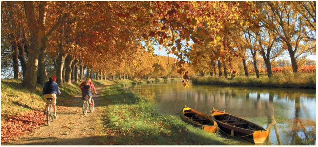
The historic Canal du Midi winds its way from Toulouse to the Mediterranean port of Sète, flowing through traditional French villages and an avenue of thousands of plane trees.

(half-timbered buildings) and open up to charming village squares. The vineyards of Gaillac produce grapes to make red wines like Syrah, Cabernet and Merlot and white wines such as Mauzac and Sauvignon. Visit the historic, French Southern Gothic-style Abbaye Saint-Michel de Gaillac, a Roman-Catholic church founded in A.D. 972 on the banks of the Tarn by Benedictine monks and consecrated by the Bishop of Albi.