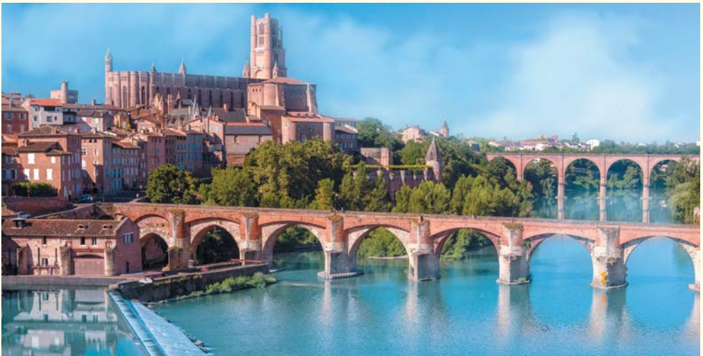
The scenic skyline of medieval Albi, known as ‘la rouge’ for its signature red-brick architecture, is dominated by the historic monuments of Cathedral Sainte-Cécile and the iconic Pont Vieux spanning the River Tarn.