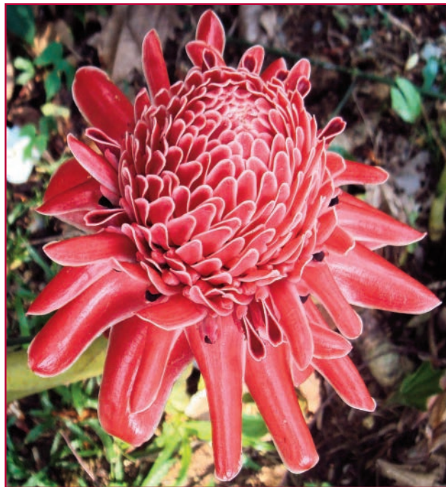
Torch Ginger, Hawaiian Tropical Botanical Gardens

For more information, please contact us at: Phone: (540) 458-8723 • Fax: (540) 458-8478 • Email: spclprog@wlu.edu