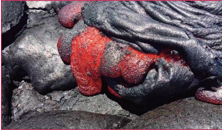
Lava Flow, Volcanoes National Park

Return to Hilo for lunch at a local restaurant, then visit Carlsmith Beach Park, with a black sand beach and beautiful views of Hilo Bay and Mauna Kea. Watch locals swim and surf. Take an optional swim, conditions permitting, and perhaps see a honu, or Hawaiian green sea turtle!