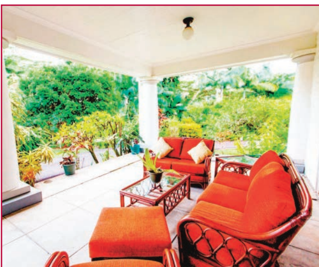
The Lanai (front porch)