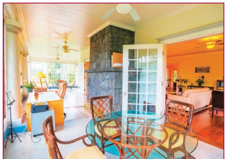
The Garden Room