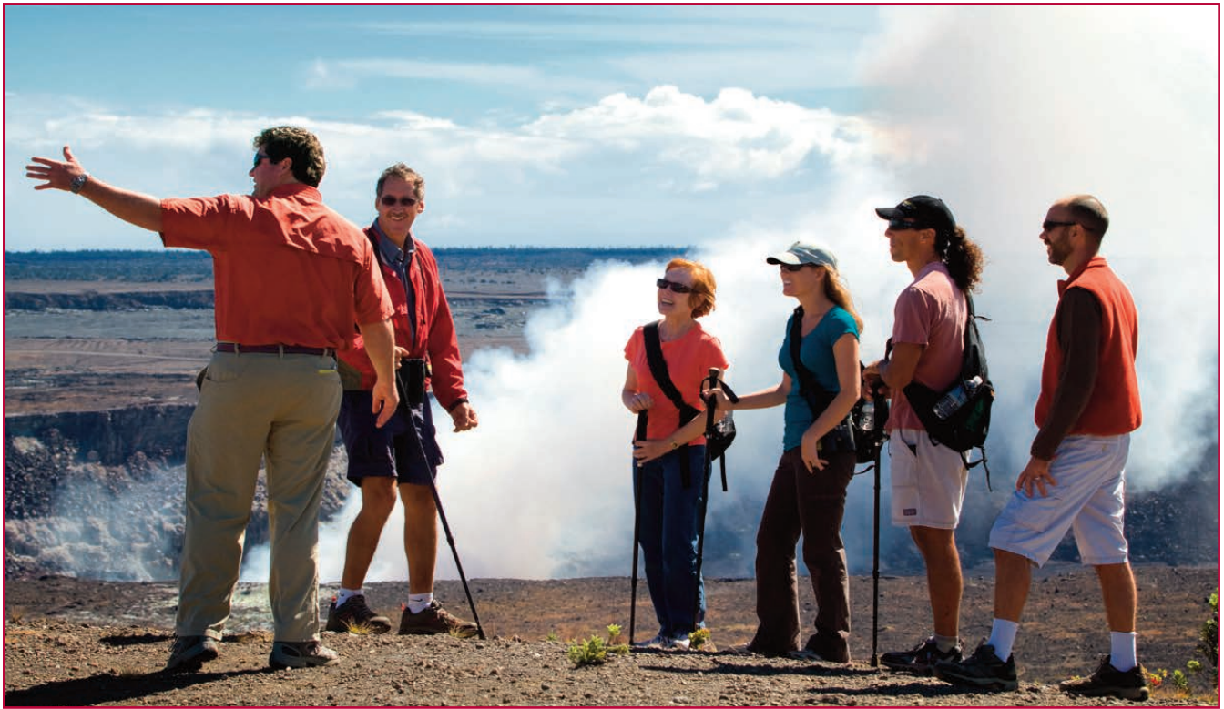
Halema'uma'u Vent, Volcanoes National Park

For those not participating in the Mauna Kea excursion, your Tour Director will help you plan the rest of your day. You can relax at your house, explore downtown Hilo, with fun shops, galleries, cafes and markets, or enjoy a traditional lomi-lomi massage at the local spa. (B, Picnic dinner for those on the Mauna Kea Excursion).