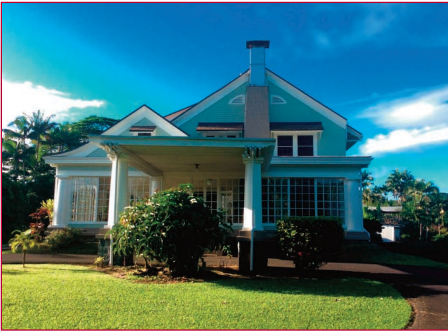
The Historic Thomas Guard House