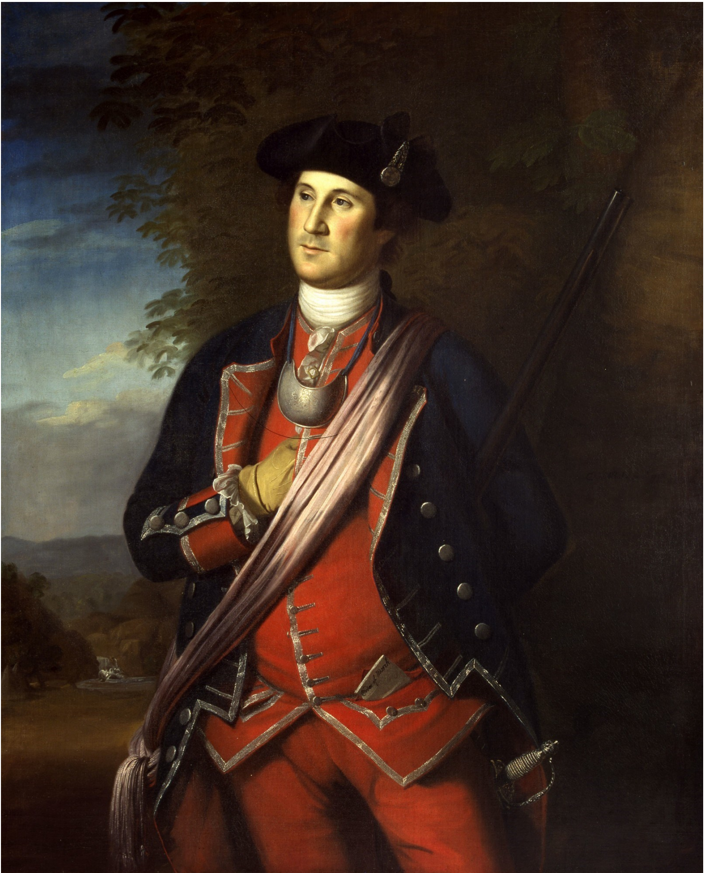
George Washington as First Colonel in the Virginia Regiment , Charles Willson Peale, oil on canvas, 1772 Washington-Custis-Lee Connection, Washington and Lee University, Lexington, VA